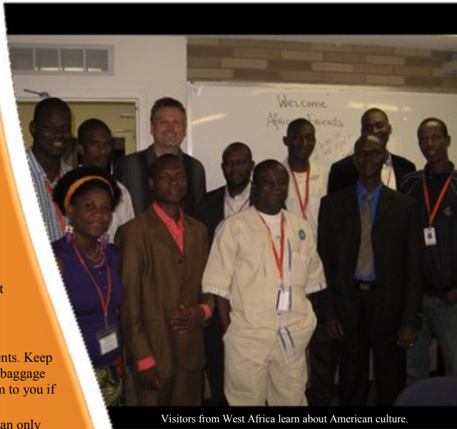
Visitors from West Africa learn about American culture.

What if I can't get registered for the term I'm returning to? Talk to your advisor about getting "paper registered" for the term. You can also get registered from your home country by contacting your academic advisor. Once you are registered, mail your I-20 to our office, we will sign the I-20 and send it back to you.