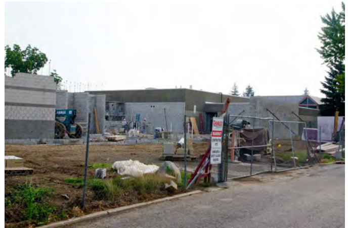
The view of the Davis Street Building is taking shape. By December, crews plan to have the main shell completed to work on interior spaces during the winter months.

to the north of Old Main, will be missing when classes begin, including a former chiropractic office, hair salon and ministry house. Those demolitions will make way for additional parking, as well as a better view of the Koehler Complex.