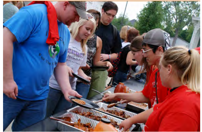
Students line up to sample chicken wings at last year's Theta Chi Wing-Off, an annual Welcome Week event.