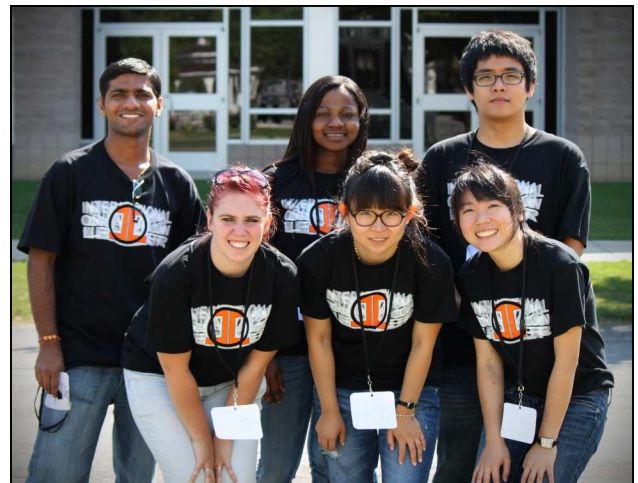
International Orientation Leaders help new students transition to UF

The Office of International Admissions and Services want to welcome the new students and our returning students to the beginning of a new academic year. We hope you make the most of your time here studying hard, meeting new friends and enjoying life here in The United States!