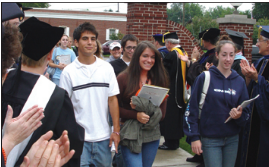
The 2004-05 academic year began officially with the traditional Arch Ceremony on Aug. 29. UF had a favorable opening to the school year.