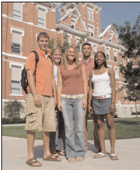
Full-time enrollment is up this year at UF, with 3,059 full-time students, compared to 3,043 students last year.

The mission of The University of Findlay is to equip our students for meaningful lives and productive careers.