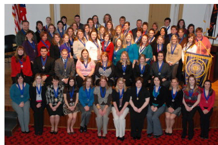
The charter class of Phi Kappa Phi Chapter 310 was inducted Feb. 25.

The charter class of the honor society Phi Kappa Phi Chapter 310 was inducted during a ceremony Feb. 25 in Ritz Auditorium. Officers for the group also were named. Phi Kappa Phi is the nation's oldest, largest and most selective honor society for all academic disciplines. Its chapters are on more than 300 campuses in the United States, Puerto Rico and the Philippines. Approximately 30,000 members are initiated each year.