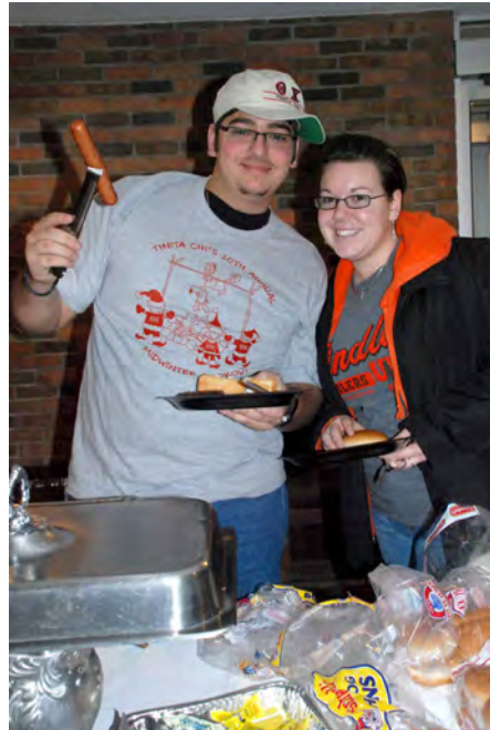
Students gather in Bare Lobby to enjoy favorite summer food at Theta Chi's Midwinter Cookout.