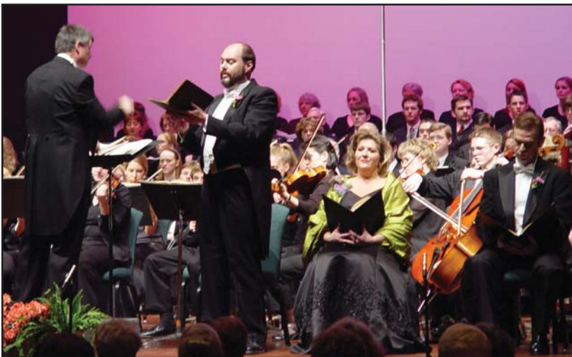
A chorus of more than 100 singers, a 34-piece orchestra and three professional soloists performed The Creation on April 18.