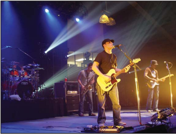
OAR performed for UF students in the Koebler Complex April 14.