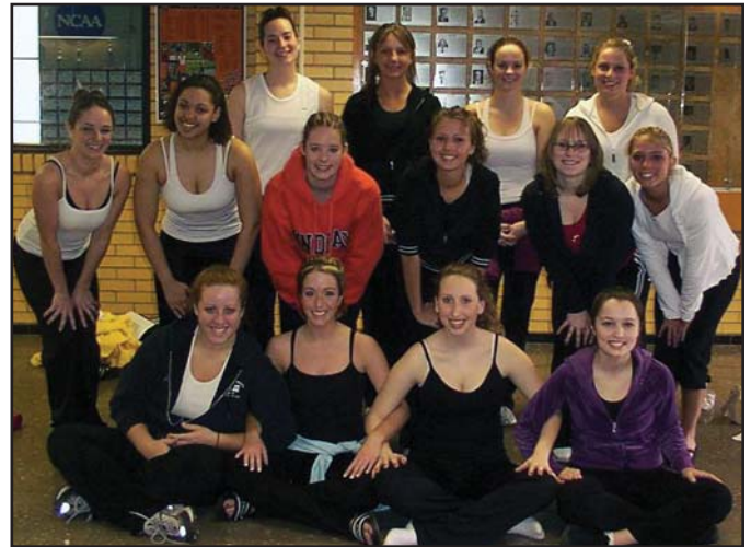
After tryouts on April 4, these women were named to the UF Dance Team.