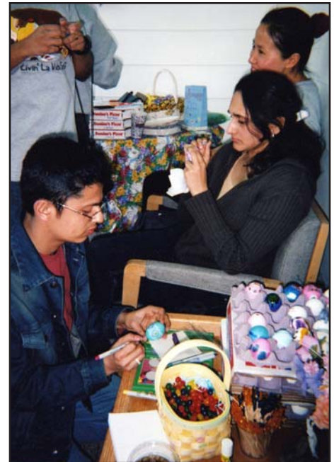
UF international students enjoyed an activity of coloring Easter eggs.