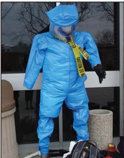
OESHO sponsored Fear Factor 2004 on April 17.