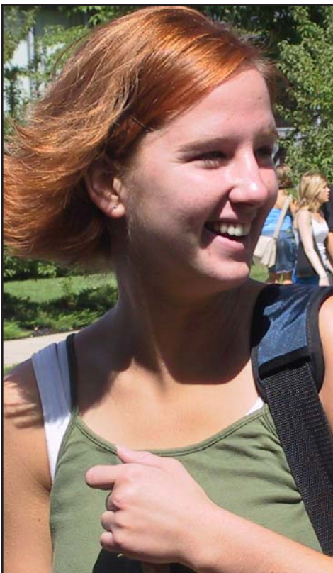
Students enjoy the warm temperatures during the first week of classes this fall.