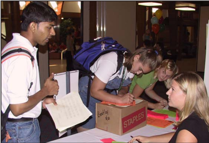
Sponsored by the Office of Career Services, the Earn and Learn Job Fair helps students find part-time employment while they continue with their studies. Here, a representative from the HOSTS program at Washington and Jacobs Schools talks with a student.