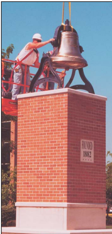
Construction workers mount the Old Main Bell on the newly built tower, located in the center of campus in front of the Gardner Fine Arts Pavilion.