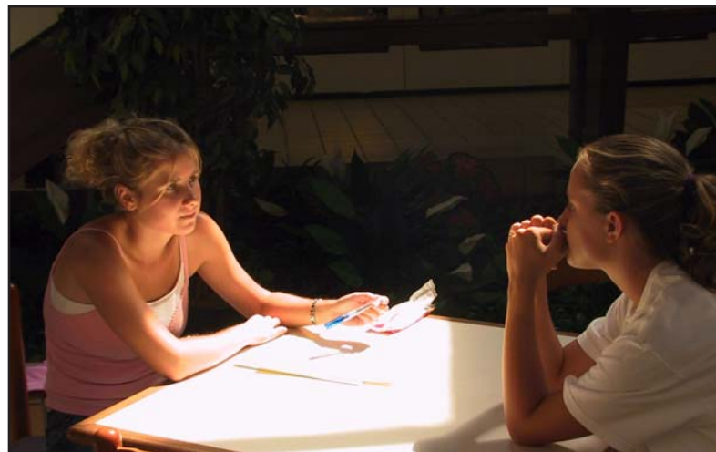
It's never too early to begin studying, as these students are demonstrating in the Alumni Memorial Union.