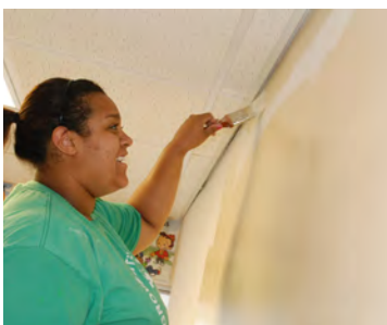
Painting at First Assembly of God on Ash Avenue.