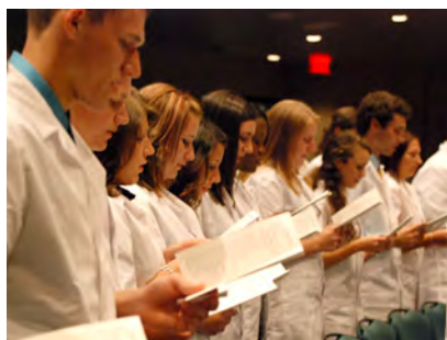
Students take the pharmacy oath after receiving their white coats.