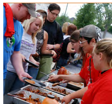
Theta Chi 15th annual Wing-off.

Welcome Week provided many activities for both new and returning students. Theta Chi held its 15th annual wing-off, and students had the option to attend a community church fair as a way to get to know local churches and Market on the Mall to become acquainted with area businesses. Other activities included a dodgeball tournament, mud volleyball, entertainment and more.