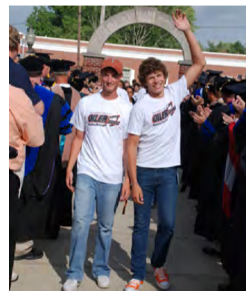
Freshmen participated in the traditional Arch Ceremony.

organizations within the community on Saturday, Aug. 21. In 2002, the University began incorporating a large-scale freshman service project into orientation weekend. New students are sent in groups to various locations in the community to complete several-hour projects that include painting, cleaning, landscaping, organizing and helping non-profit organizations and churches with projects they otherwise would not be able to complete. On Sunday, Aug. 22, students attended a welcome ceremony in Winebrenner Theological Seminary and participated in the traditional Arch Ceremony on the front lawn of Old Main. Click here to see more photos from both the service projects and the Arch Ceremony.