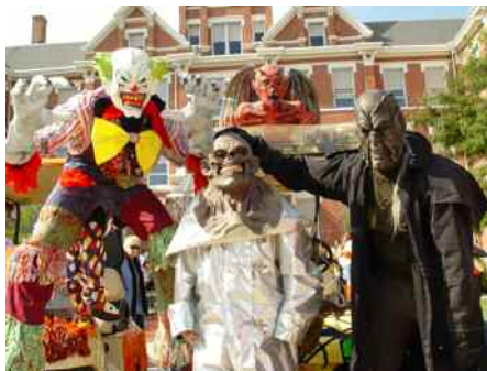
The Oiler Environmental Safety & Health Organization (OESHO) won first place in the golf cart parade for the second year in a row.