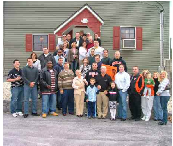
Members of the 1997 national championship football team and their families returned to Findlay Oct. 27 to celebrate the 10-year anniversary of their 14-0 undefeated season.