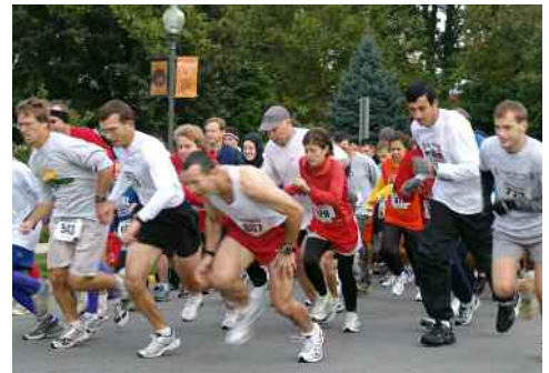
The 5K and Little Oilers Fun Run kicked off Saturday's Homecoming events.