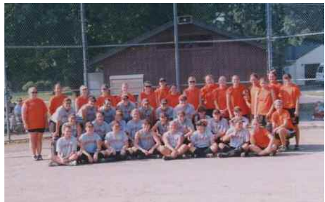
Women's softball alumnae played the current UF women's softball team during the second annual women's softball game Oct. 6 at Riverside Park.