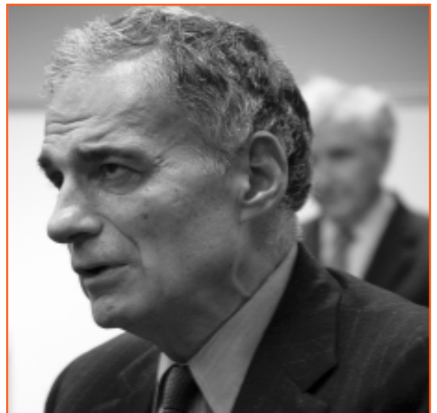
Independent presidential candidate Ralph Nader discussed the political process and social justice on campus Oct. 25.