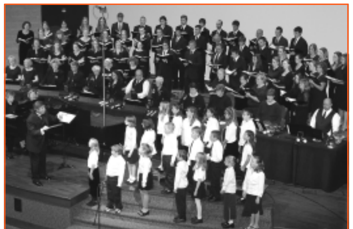
UF's Concert-Chorale, the Old Millstream Ringers bell choir and the Washington Intermediate School Chorus presented "Sing and Ring in the Season" on Nov. 21.