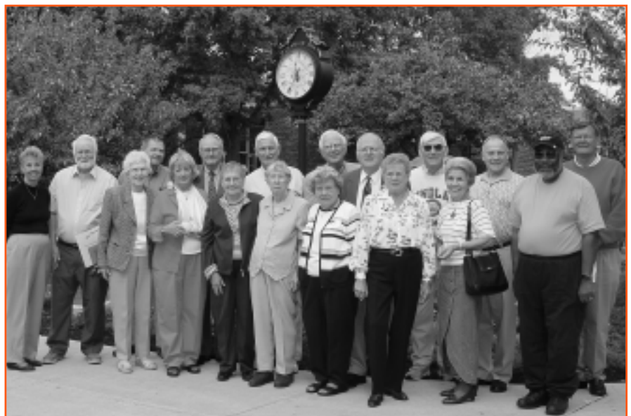
Members of the Class of 1954 gathered for their 50-year reunion and the dedication of the new campus clocks.