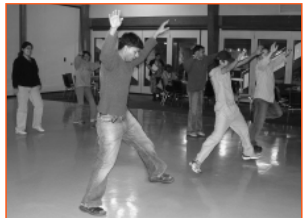
The International Club sponsored a Cultural Dance Night Oct. 21, in which students taught each other dances associated with their native countries.