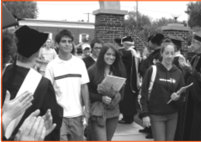
The 2004-05 academic year began officially with the traditional Arch Ceremony on Aug. 29. UF had a favorable opening to the school year.