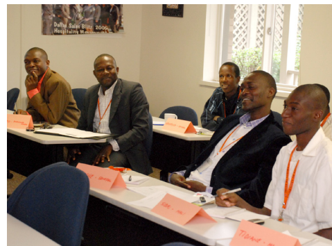
Selected individuals from Burkina Faso, Chad, Mali, Niger and Senegal attended classes at The University of Findlay to learn business and entrepreneurial skills as part of the Trans-Saharan Professionals Program, co-sponsored with the Findlay Rotary Club.

Late last month, 11 individuals from Africa arrived on campus as part of the Trans-Saharan Professionals Program, intended to address unemployment rates among young adults in Africa by offering entrepreneurship education and experiential learning through on-site training. In August 2010, the University announced that it received a nearly $600,000 grant from the U.S. Department of State's Bureau of Educational and Cultural Affairs Fulbright Program to fund the Trans-Saharan Professionals Program. Coordinated through the College of Business, the program teaches skills in identifying a market, managing risk, raising start-up funds, designing a business plan, supervision, advertising and understanding the legal environment for business development. The University is working with Rotary International as a partner organization to assist in the project. In addition to learning small business development skills, the program participants are apprenticing with local small business professionals in their chosen fields, identified with the help of the Findlay Rotary Club, who will provide on-site learning experiences and business expertise. The group will be in Findlay until June 12.