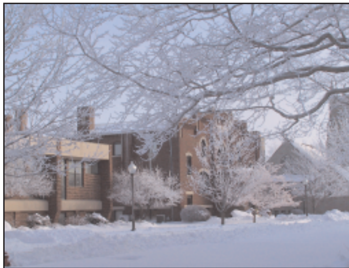
Winter beauty on campus.

Gifts and grants through Dec. 31, 2005, were $2.2 million, compared to $1.3 million the year before. December giving was ahead of recent years, partially as a result of a $1 million cash gift for