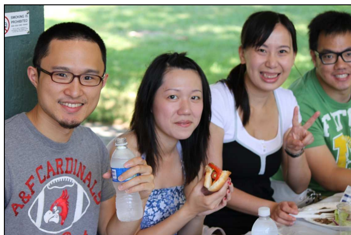
Students sample traditional American BBQ food at Riverside Park.

This year international students got to try their hand at bowling at Sportsman's Lanes here in Findlay. They traveled to the rollercoaster capital of the world, Cedar Point, to test their nerve on the Magnum, Top Thrill Dragster and many of the parks other thrill rides. ( see pictures inside this issue ) The students slowed things down from the thrill seeking Cedar Point trip to experience the more relaxed way of living in Amish country which included buggy rides, petting zoo and an Amish feast. We wrapped up the summer with a traditional American BBQ at Riverside Park in Findlay. Students got to sample hot dogs, hamburgers and chicken cooked over a charcoal fire, various salads and deserts. Following lunch they tried their hand at sand volleyball, paddle boats, and other outdoor games. As fun as the Fridays are, the real fun is experiencing it all with our students.