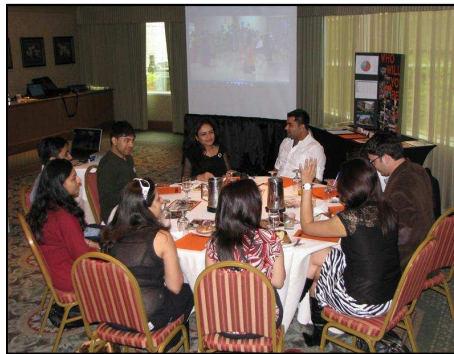
Talking about Good Times at UF