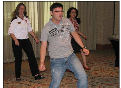
Performing a Staff Favorite Dance