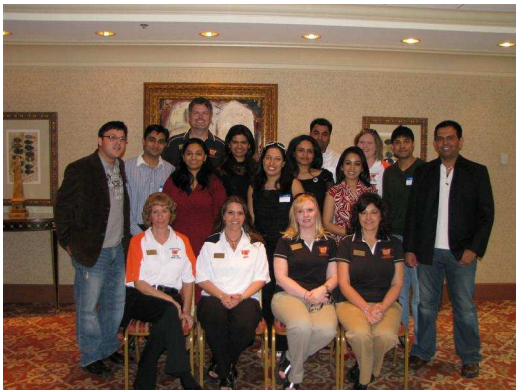
Alumni and Staff

On Saturday, May 9, 2009, the Office of International Admissions and Services hosted an alumni reception for those students living in and around the Chicago area. The reception was held in the Wyndham Hotel downtown Chicago and ran from 10:00 a.m. - 12:00 p.m. Ten students were present with one flying in from Baltimore and another from Indianapolis. Refreshments were served, a video highlighting the changes in the university was presented and door prizes were given away. All the students expressed their appreciation and gratitude to once again see old friends, the staff and to share memories of The University of Findlay.