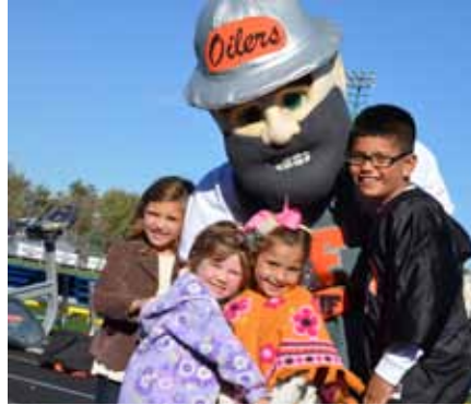
Derrick the Oiler is a big attraction for young Oilers fans.