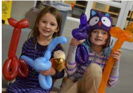
Face painting and balloon animals were among the many activities for the kids.