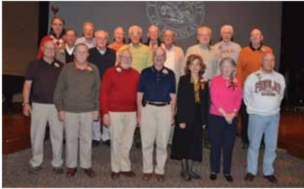
Members of the Class of 1961 proudly gathered for a group shot at the Alumni Breakfast where they were recognized for their 50th anniversary.