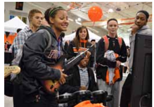
Brought back for a second year as a part of the Homecoming carnival, Rock Band proved a very popular activity with students.