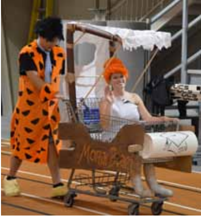
Members of Mortar Board honor society impersonated Fred and Wilma Flintstone during the Homecoming parade in Koehler Complex that featured shopping carts decorated by student organizations.