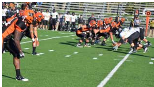
The Oilers football team came through for the fans with a 27-24 win against the Ohio Dominican Panthers.