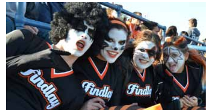
These UF fans couldn't mask their excitement at the game between the Oilers and Ohio Dominican at Donnell Stadium.