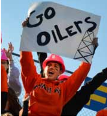
Fans in the stands show their Oiler spirit cheering the home team.