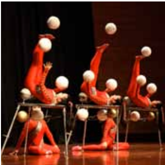
The Golden Dragons performed award-winning acrobatics and traditional dances to ancient and contemporary music as part of Diversity Month in October.

11 p.m. Monday, Thursday and Friday and noon to 8 p.m. Saturday and Sunday. Menu items include chicken wings and Rig chunks with choice of sauces, Rig fries, sandwiches and decadent desserts. Call 419-434-4156 or email rig@findlay.edu for more information, or search for The Rig on Facebook. The Rig is a division of Oiler Enterprises, a newly formed entity for the purpose of developing student-run businesses. Click here to view The Rig's menu.