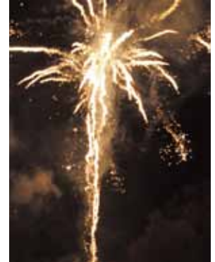
An impressive fireworks display lit up the sky for Oilers fans on Friday evening.