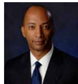
Byron Pitts of CBS News