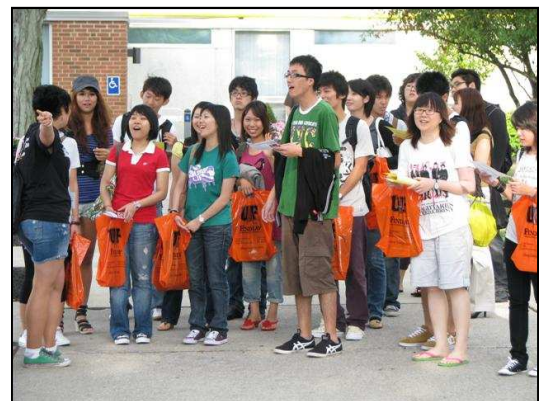
New Students Tour the UF Campus

The International Link: You're reading it now! The Link is a monthly newsletter put out by the office of International Admissions just for F-1 students. In it you will find immigration updates, events, photos and more. Look for it at the end of every month in your UF email.